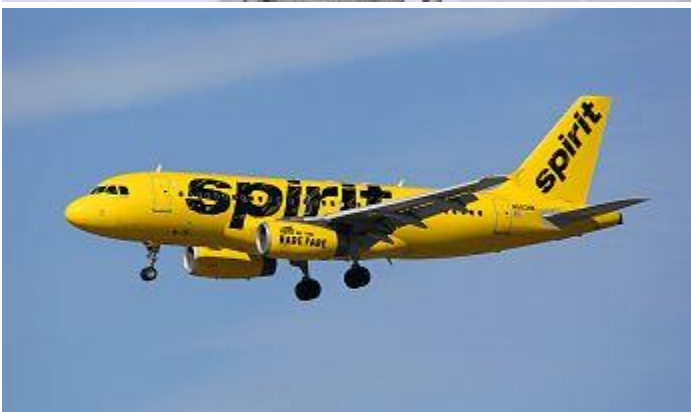
• 10 Airlines That Customers Love to Hate