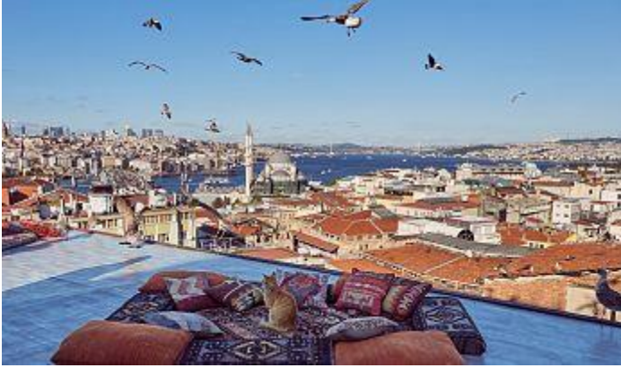
• Why are There So Many Cats in Istanbul?