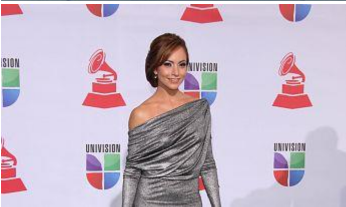
• Famous People From Honduras