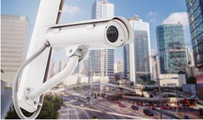
• The World's 10 Most Surveilled Cities