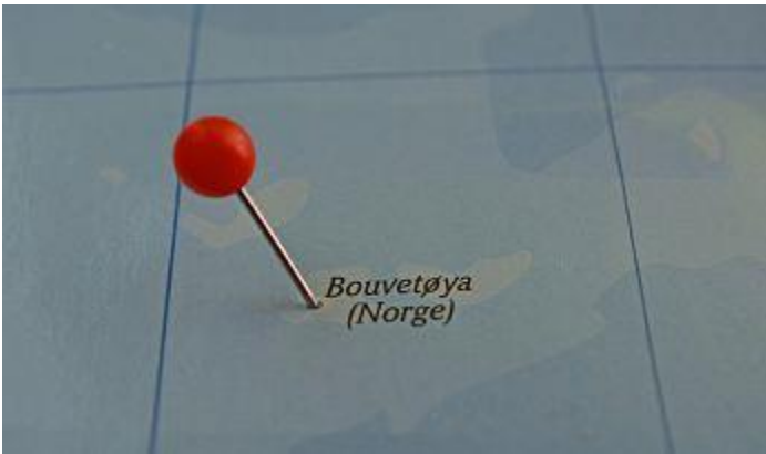
• Where is Bouvet Island?